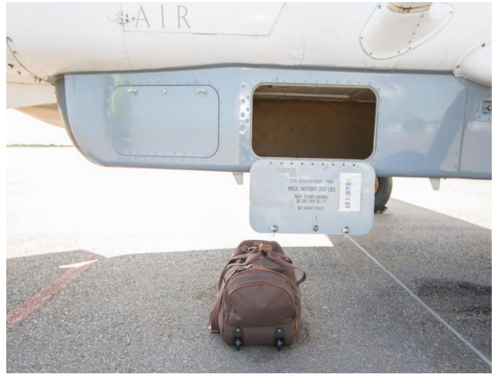
Luggage Pod/Baggage Compartment