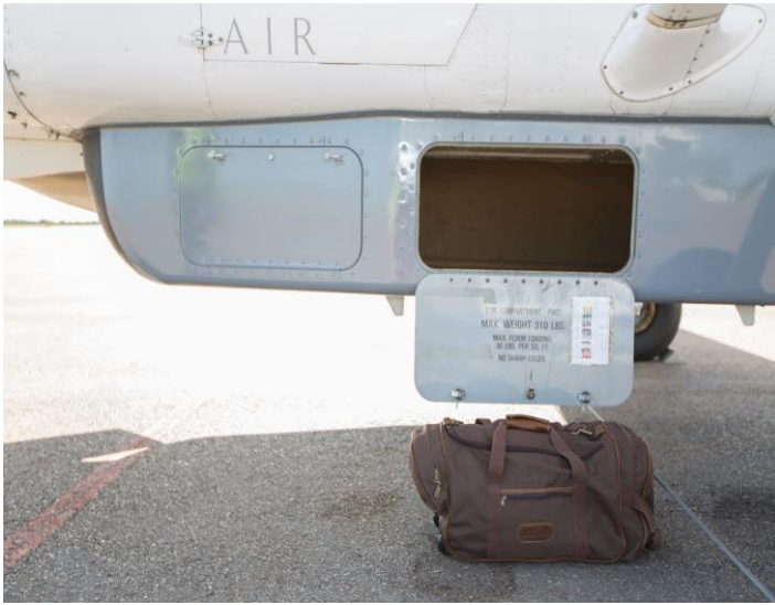
Luggage Pod/Baggage Compartment