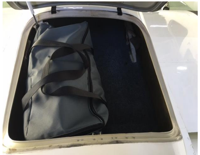
Reims 406 Luggage Pod/Baggage Compartment (Wing Locker)