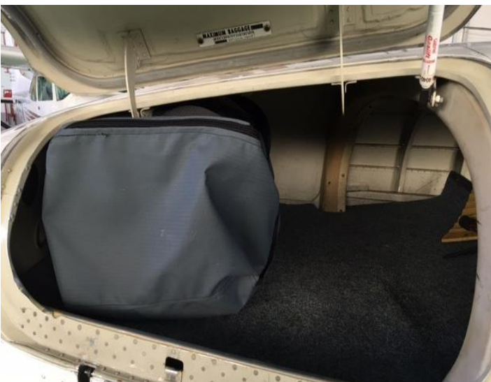
Reims 406 Luggage Pod/Baggage Compartment (Forward Nose)