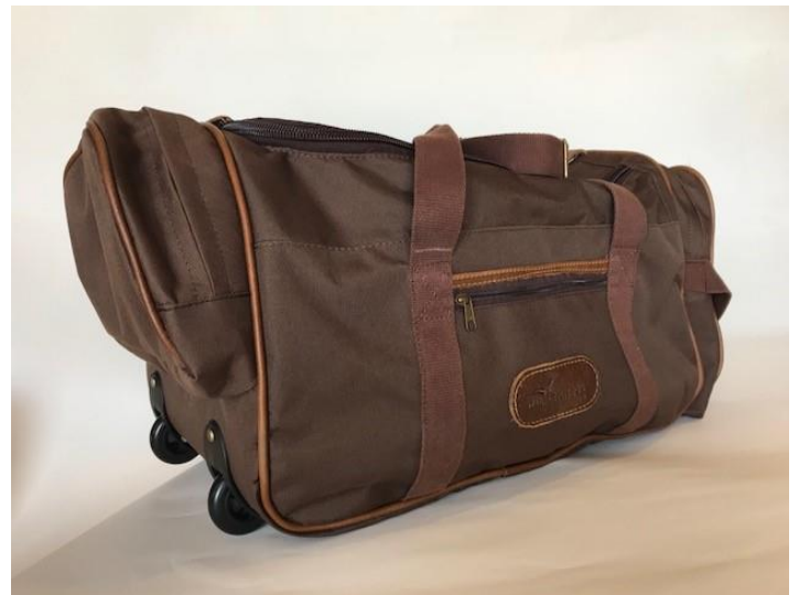
Wilderness Safaris Travel Bag