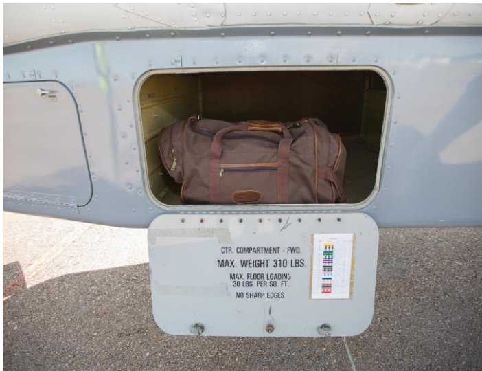
Luggage Pod/Baggage Compartment