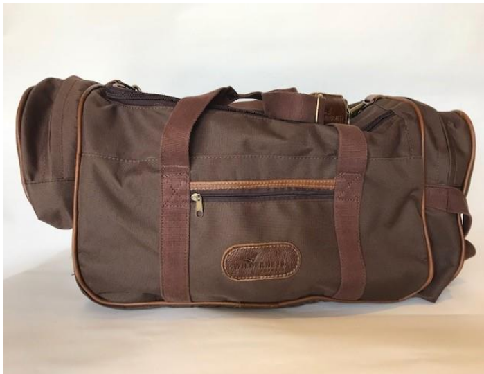
Wilderness Safaris Travel Bag